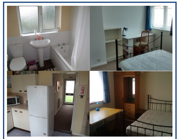
Rooms from this property

All rooms are for storage only during 2 summer months. There is an option of residing for 20%pcm additional fees.