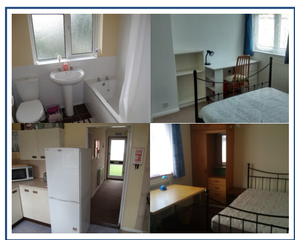
Rooms from this property

All rooms are for storage only during 2 summer months. There is an option of residing for 20%pcm additional fees.